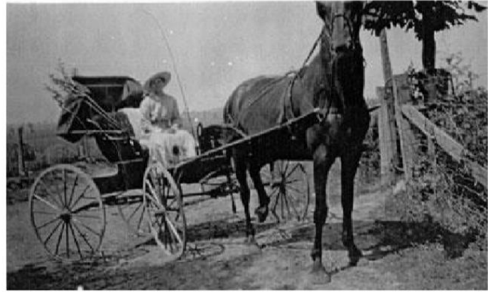
*Not woman in article*